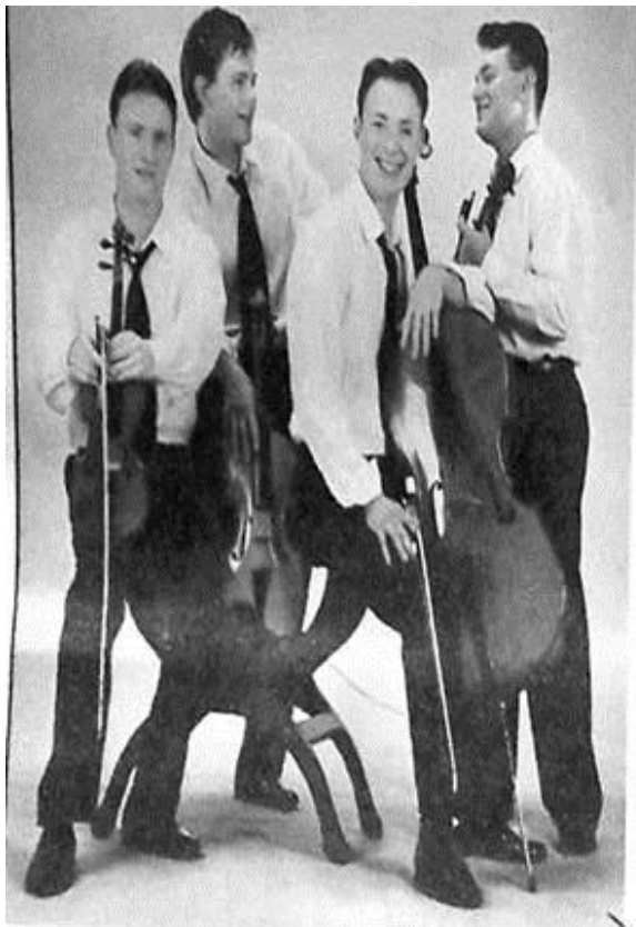
Jerusalem String Quartet